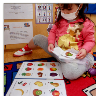
Fruit Matching Game

Koki loves squishing, squashing, rolling the play dough into orange shape. Play dough is a wonderful sensory material, which also helps to develop motor skills.