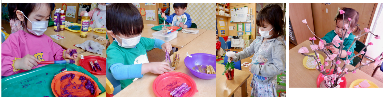
Clothespin flower pot

Seeds class were so excited to see the weather get warmer and the season begin to change. With spring in the air, our theme this month was 'We Thank God for Plants', 'My world has many colors and shapes' and 'We have fun with friends'. Children were really responding well to these units. They look forward each week to learning and practicing new skills. They love placing a sticker on their incentive small bucket after each day. We have been busy planting flowers, getting to know the plant of life-cycle, different types of Seeds. Children learn by observing, listening, exploring, experimenting and asking questions. Under the unit of 'My world has many colors and shapes', children began to discover that God made a beautiful world filled with many different colors and shapes. Over a week of learning activities, children had an opportunity to have many hands on experiences, they learned how to do sorting objects by a single attribute - color, shape and size. In addition, in interacting with friends, children learn some social skills such as: how to communicate, be cooperative and solve problems. We would like to share with you the fond memories from the Seeds. Please remember to check our unit newsletter for further information.