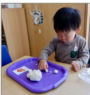
Fruit Play Dough Creation

Puzzles are a fun educational learning tool for young children as they provide fine motor skills, hand and eye manipulation skills, cognitive skills, problem-solving strategies is the progression of puzzle solving. Under this activity, students get to know "God is good to us". He made flowers for us to see and enjoy. Some plants produce pretty flowers. Children have a great opportunity to identify and recognize some of the flowers, such as, Roses, Daisies, Lily, Sunflowers and Tulips. The accomplishment of achieving a goal brings so much satisfaction to a child.