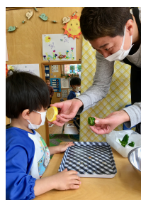
Exploring Seeds simple science for preschoolers

In this activity, students explore seeds in various ways, from comparing size and quantity of seeds in different foods. and to identifying the color and texture of the seeds. It includes pumpkin, lemon, green pepper and avocado. This was a perfect seed activity for preschoolers to work on their observation and counting skills. They even spend some time smelling the seeds. Everyone was highly focused on their tasks.