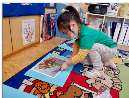
Playing with flower puzzles

Hannah love scrunching the pieces of tissue paper into mini flowers and glued them onto the branch. It is a fun process to have our own mini cherry blossom tree inside our classroom.